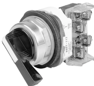
Knob Lever Operator Cat. No. 800T-J17A