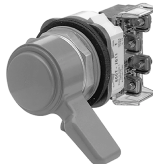
Metal Wing Lever Operator Cat. No. 800T-JG11A